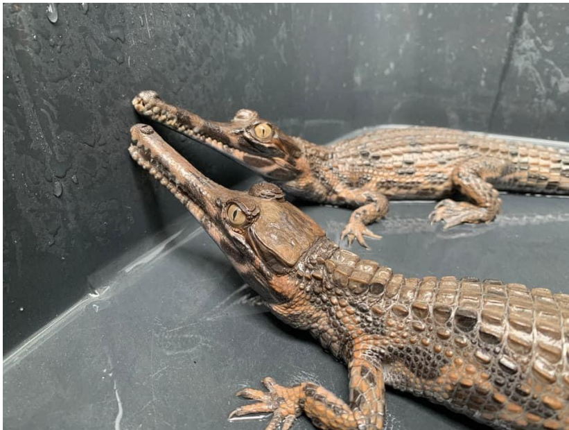
Figure 1. Juvenile False Gharials Tomistoma schlegelii offered for sale on Facebook in 2024.

A total of 15 False Gharial Tomistoma schlegelii (Fig. 1) individuals were offered for sale by four traders during the survey period. All individuals were juveniles, each measuring approximately 30 cm in snout-vent length (SVL). Based on publicly available information, three traders were in the National Capital Region (NCR) and one in Region VIII. The advertisements offered between one and three individuals, with a single trader offering nine individuals. Two traders stated that they possessed legal permits to trade (Fig. 2). During the survey period, 13 groups were deactivated and another 14 groups became inactive. These were immediately replaced upon detection with more active wildlife trade groups (Table 1).